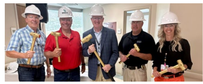
Hospital and community leadership celebrated the start of construction on NNRH's inpatient behavioral health unit in June 2024.